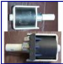
Factory Installed Flojet ET508224B Ocsillator 115 Volt High Pressure 1/8" Nptf Ports Part AP30 C378 55psi